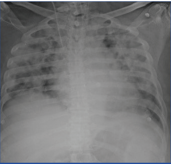
[Table/Fig-6]: Chest X-ray showing non homogenous opacities involving both side lung field.

A 60-year-old diabetic and hypertensive male patient, presented with fever, cough with expectoration for six days, and shortness of breath for three days. He was managed in the emergency ward with mechanical ventilation, vasopressor support and empirical antibiotics (meropenem and teicoplanin). The patient had neutrophilic leucocytosis and high HbA1c (7.8%). Bilateral non homogenous opacities were seen on chest X-ray [Table/Fig-6] and the endotracheal tube aspirate culture showed growth of S.maltophilia . As per the sensitivity report, empirical antibiotics were stopped and high dose of TMP-SMX (TMP equivalent dose of 15 mg TMP/kg/day IV divided q8hr) was started. After two weeks of management in critical care unit, his clinical condition started improving and one week later he was discharged with an advice for regular follow-up and is doing well [Table/Fig-7].